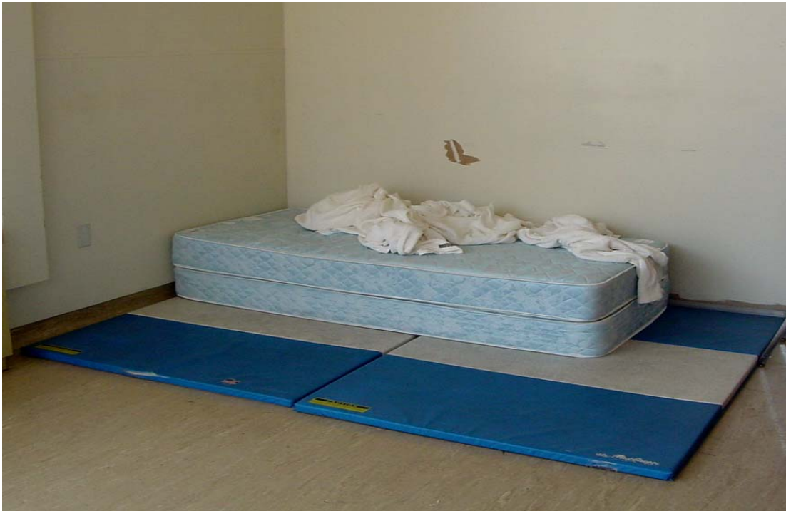
Sleeping arrangement for an individual living in seclusion at Rosewood: bare mattress, no pillow, no personal effects.