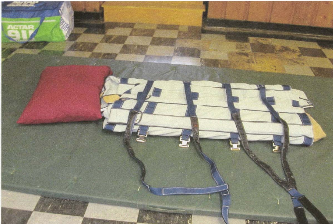
A Safety Coat

safety coat, wrap it around the entire body, and fasten straps securely so that the individual cannot move his or her limbs. Both resident and staff are at risk of physical and psychological injury during the struggle. Particularly vulnerable are individuals who have post traumatic stress disorder resulting from past assault or abuse, people with health conditions such as obesity or asthma, or those taking medications that put them at risk of heart attack.